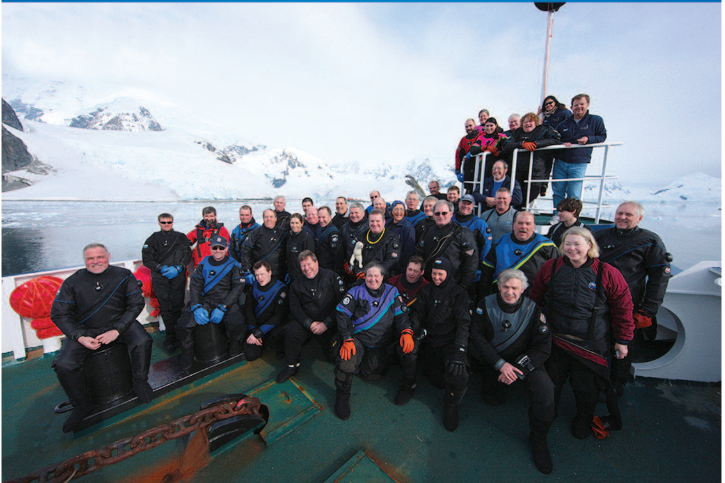
DUI DOG Trip Antarctica • March 12, 2010 • Photo by Amos Nachoum / www.BigAnimals.com